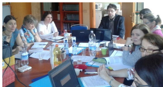
First partnership meeting in Carpi/IT

In order to make a valuable contribution to the enhancement of the labour market integration of elderly family carers the partnership of the ELMI project composed of organizations from Italy, Romania, Austria, Czech Republic and Poland will offer family carers the opportunity to strengthen their skills with an e-learning based course that will be transferred from Italy to Romania and give them not only useful information for their informal caring role but also a solid background to start from when looking for a job in the care field.