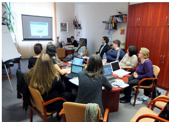
Partnership meeting in Lodz/PL

After a comprehensive and efficient preparation work the international partnership is now transferring the e-learning training course for informal caregivers to Romania, Poland and Czech Republic including all necessary adaptations in order to meet the respective context of the different countries.