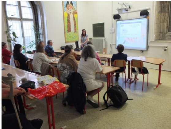
The meeting with pilot testers in Prague

On the 29 th of May 2015 the meeting with 10 selected participants was held in the Girls Catholic School in Prague. The ELMI project and e-learning course was introduced.